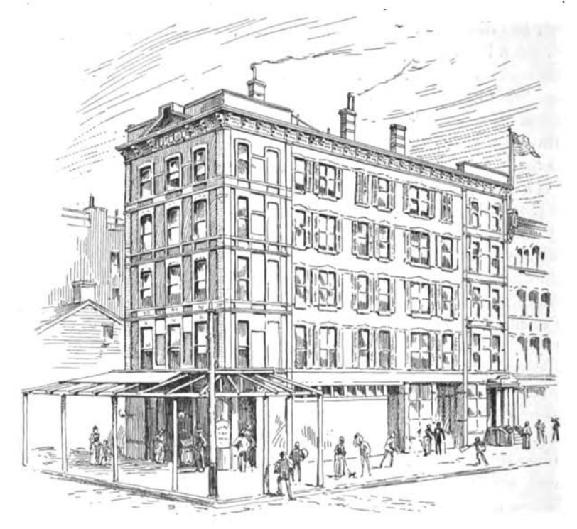
. THE HOUSE IN WHICH "ISIS UNVEILED" WAS WRITTEN.

ment. A flat was taken afterwards on the corner of 47th street and Eighth avenue, in the house which is shown in the picture.